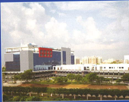
Eros City Square Rosewood City, Sector 49-50, Gurgaon