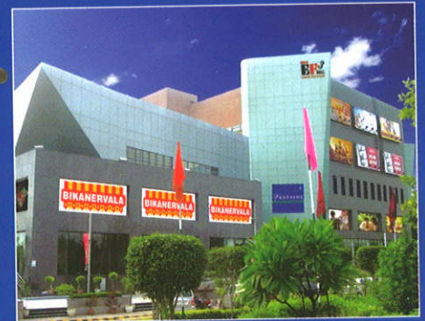
EF3 Mall NH-2, Faridabad