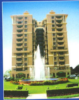
Royale Retreat Charmwood Village, SurajKund Road, Faridabad