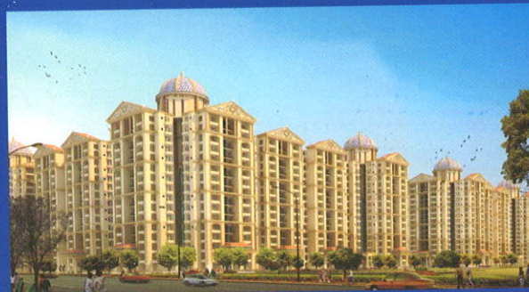
Eros Sampoonam Greater Noida