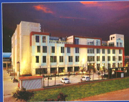
Eros Metro Mall Dwarka, New Delhi